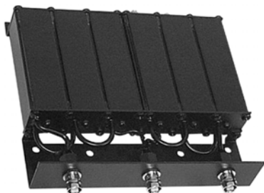
66316-1/MD & 66316-1/MC